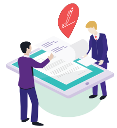
Ready to eClose!